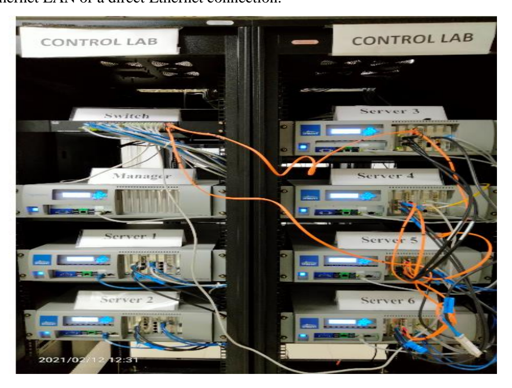
Fig 1: Control Lab Set-up